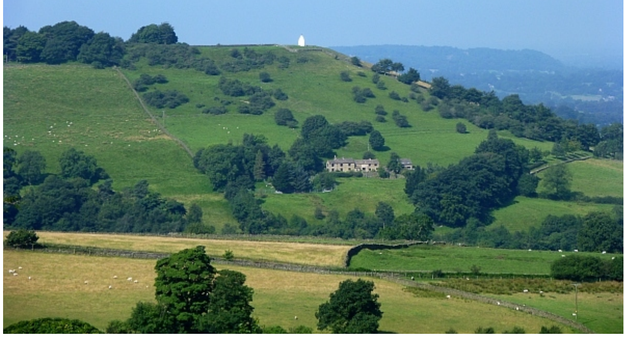
The view from Jumper Lane towards White Nancy

Go though the gate at the top of the field and turn right onto the bridle track, Oakenbank Lane. At the end of the track, take the left fork into Smithy Lane, then continue onwards and upwards into Jumper Lane. Follow the sign 'Restricted Byway' uphill and, at the top of Jumper Lane, you will be rewarded with some magnificent views across the Cheshire Plain. Turn right on reaching the end of this lane, but pause for a while, sit on the bench provided and admire the views back to White Nancy at Bollington, The Nab, Alderley Edge and, in the far distance, the hills of North Wales.