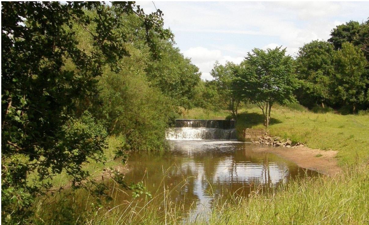
The weir in the River Bollin

Just before the houses, go through a kissing gate and turn left – spot the weather vane on the garage in the shape of a racing car! Follow the waymarks until you reach a three-armed signpost. Turn left here (tempting as it is, do not cross the stile) then right at the next stile to follow the Bollin. Cross Varden Bridge at the main road and soon you will hear – and then see – the impressive weir (12) in the Bollin.