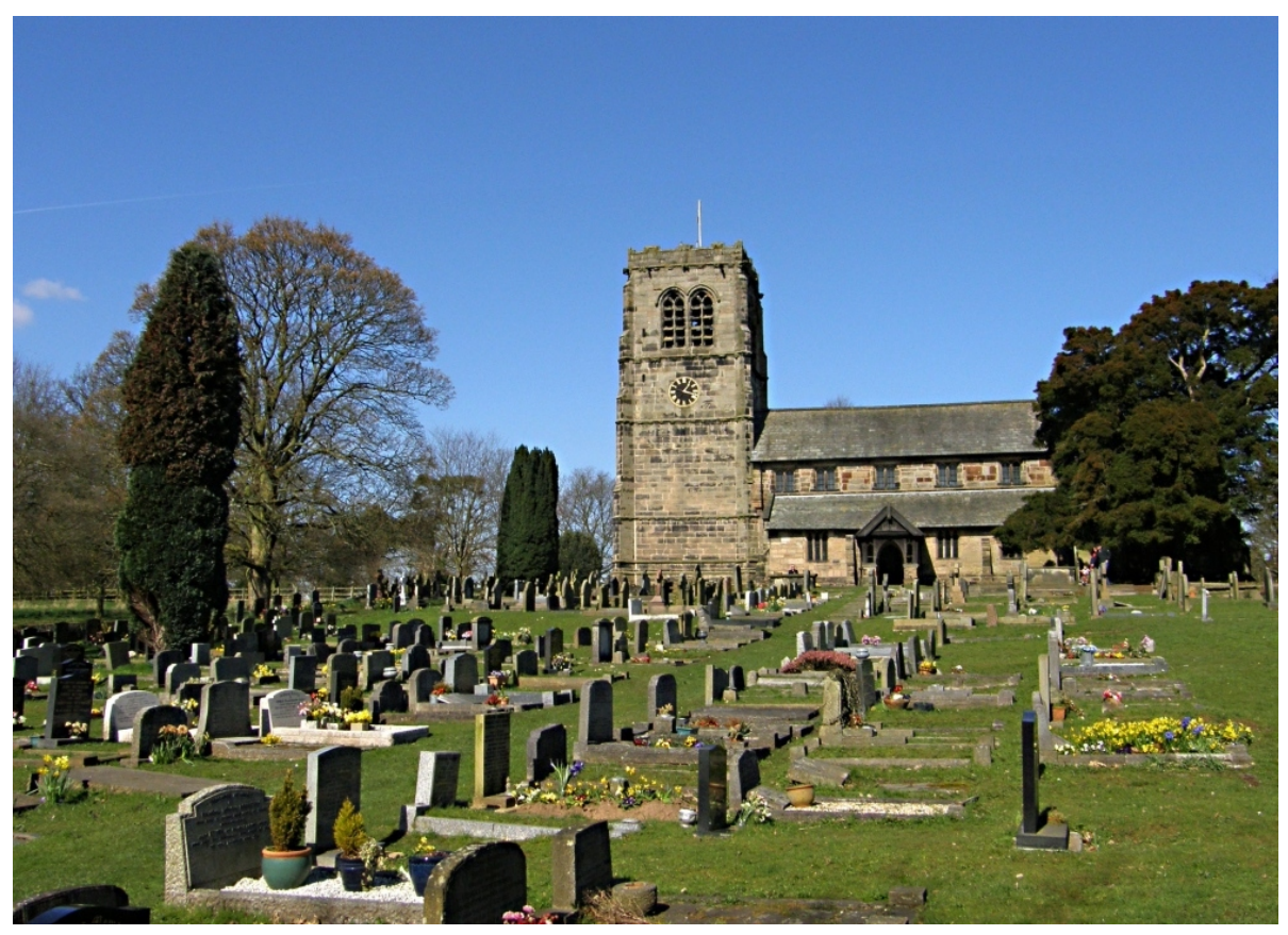
St Wilfrid's, with its enormous churchyard

rarely open, except for services, but it does have some interesting features, including the Mallory memorial window, that can be seen online at http://tinyurl.com/ctk28n. For a history of the village, go to www.mobberley.info.